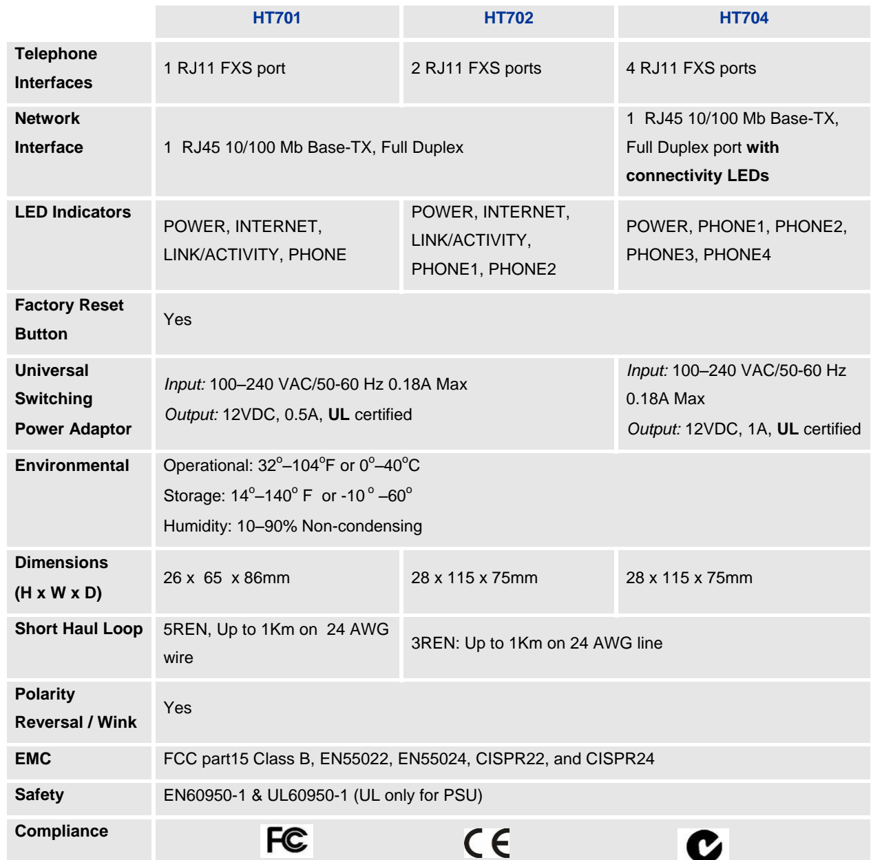
TABLE 5: HT70X HARDWARE AND TECHNICAL SPECIFICATIONS

The table below lists the Hardware and Technical specification of HT70X.